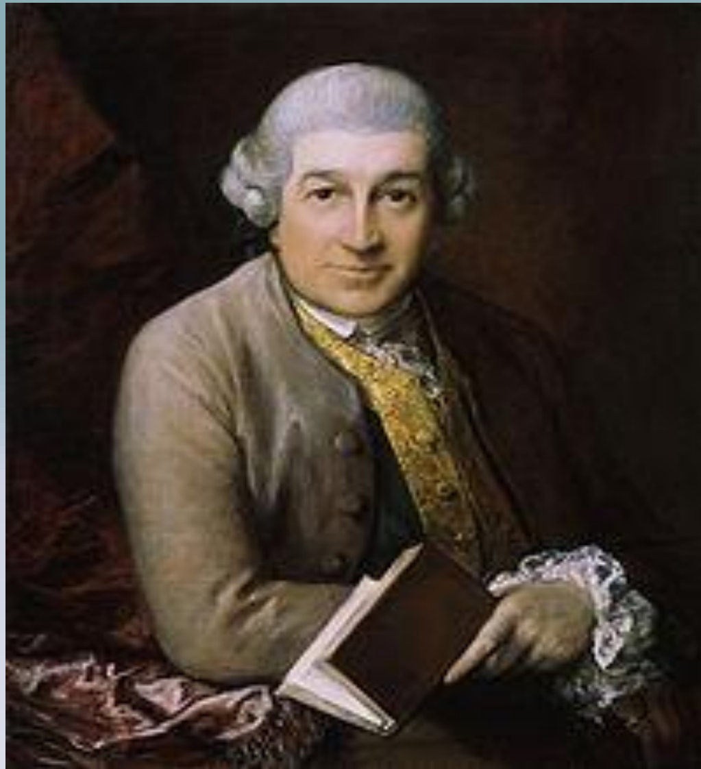
TOMAS GAINSBOROUGH (1727-1788)