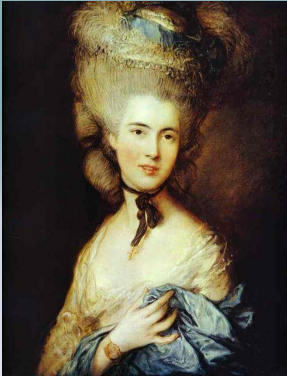
Lady in Blue (1770)