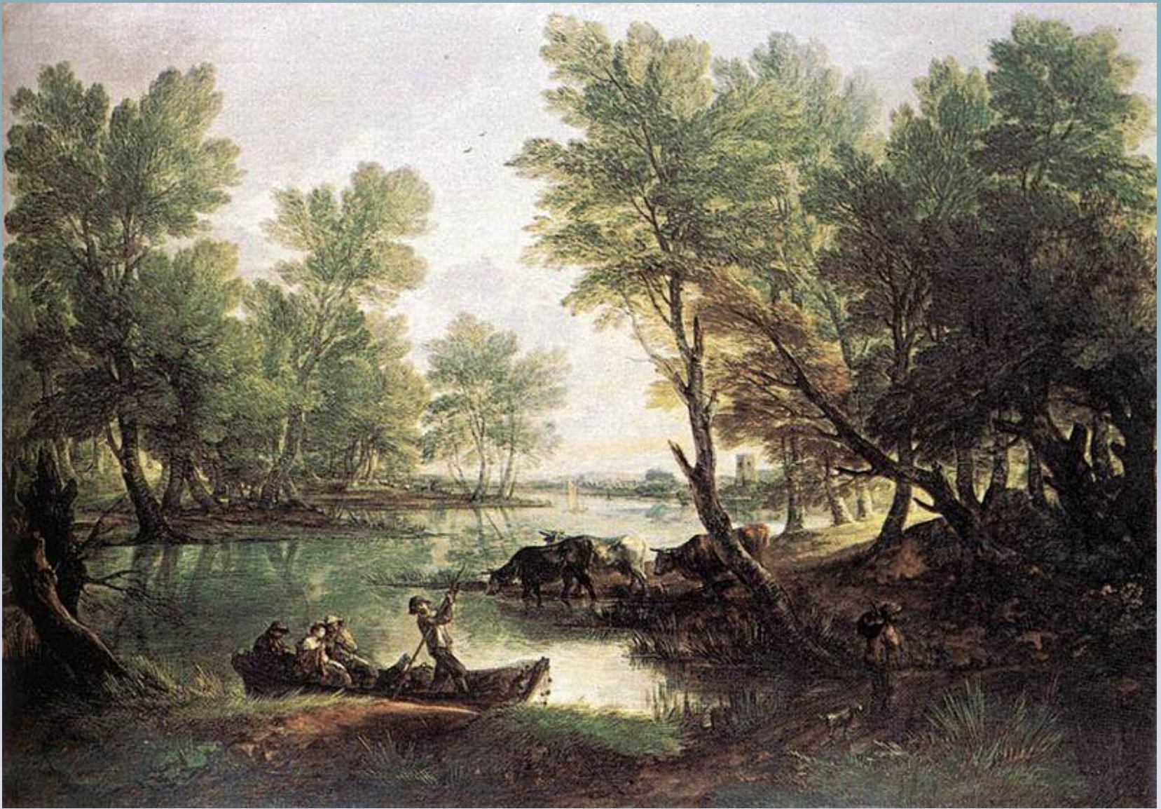
○ River Landscape (1768–1770)