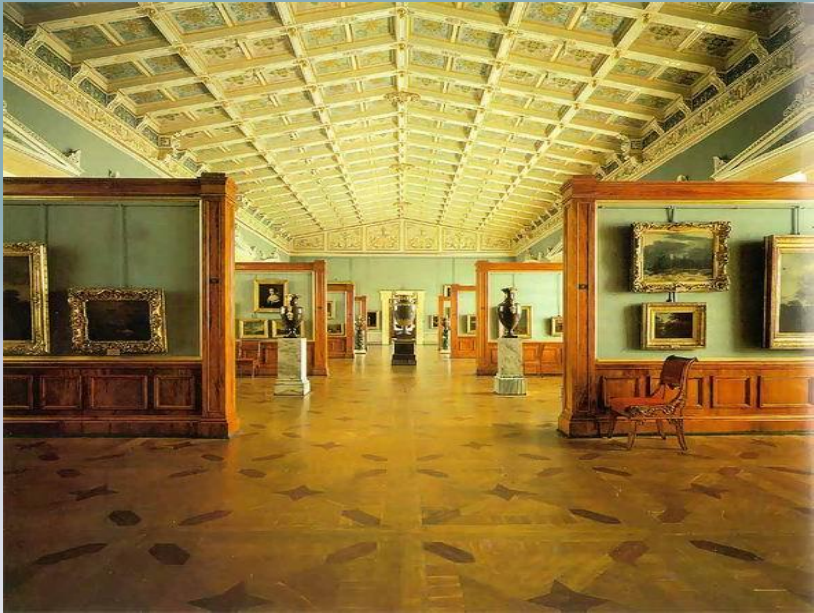
○ St. Petersburg, the Hermitage, the Dutch Hall